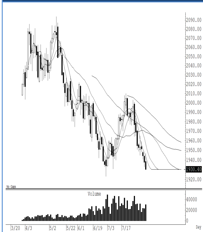
GOU23 (Close 1,930.40 Chg -7.30)

ราคาทองคำโลกแกว่งออกด้านข้าง อาจมีพื้นที่บ้าง ไม่ข้าม 1,950 ดอลลาร์ น่าจะ sideway down ต่อไป เราแนะนำยกการ์ดสูงหรือตั้ง stop ไว หรือแนะนำ trading ในกรอบ 1,945-1,911 ดอลลาร์ ระวังกำไร แต่ถ้าในกรณีที่ปิดต่ำกว่าระดับ 1,910 ดอลลาร์ แนะนำ ถือ short หวังผลปรับตัวลงไปแถว ๆ 1,880 ดอลลาร์ ระวังกำไร